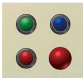
配合人機操作控制面板 Individual spindle control