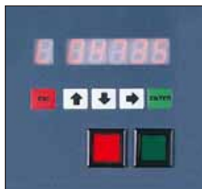
多功能微電腦控制面板 Micro processor controller