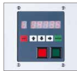
多功能微電腦控制面板 Micro processor controller